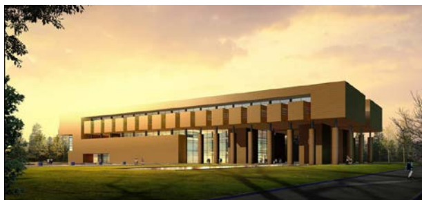
Figure 1 Universities

and universities in the process of enrollment, should pay attention to the targeted, specific knowledge of the assessment, to ensure that the students themselves have a certain artistic basis, for students to learn in the future, for the cultivation of talent in colleges and universities to lay a solid foundation.