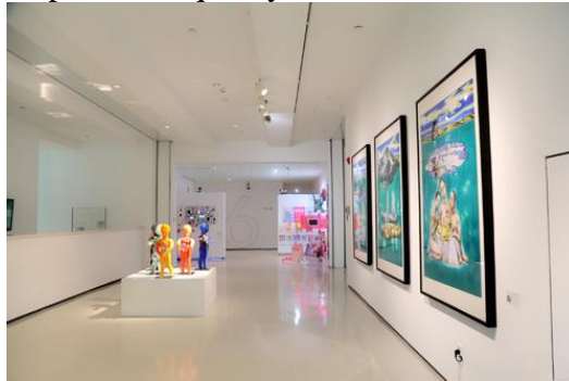
Figure 3 Universities

and design talents, which makes more problems appear in the process of talent training, which has a certain negative impact on improving students' comprehensive ability literacy. According to the investigation and research, the demand for art and design talents is increasing, especially for some industries that need high-quality art and design talents, only high-quality professionals can meet the needs of work. Therefore, colleges and universities should attach importance to the quality of teaching, optimize the level of running schools in colleges and universities, train art design students with certain creative thinking ability through the professional learning environment, improve the social market competitiveness of art design students, constantly improve the teaching facilities of colleges and universities, and improve the quality of teachers.